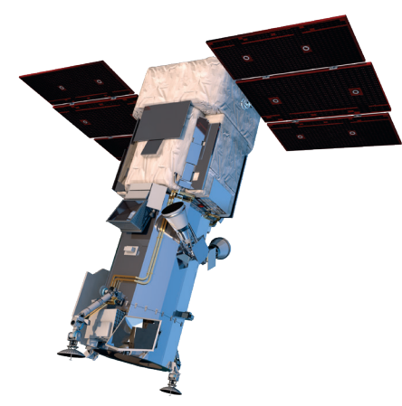
WorldView-3 artist rendering